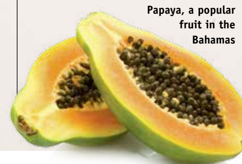
Papaya, a popular fruit in the Bahamas

In other words, immigrants have changed America, but America has also changed them.